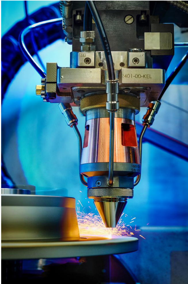
Image 1: Coating a brake disc with the EHLA process.

FRAUNHOFER INSTITUTE FOR LASER TECHNOLOGY ILT