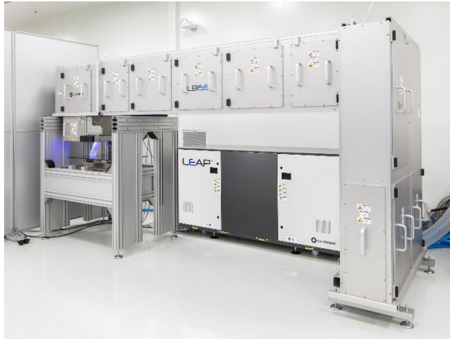
Image 2: A new excimer laser system is now available at Fraunhofer ILT for process development in surface microprocessing.

----- PRESS RELEASE July 5, 2018 || Page 3 | 3 -----