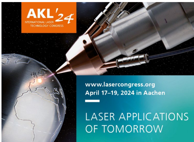
Image 4: AKL'24 – the comprehensive insight into the world of laser technology at the interface of business and science.