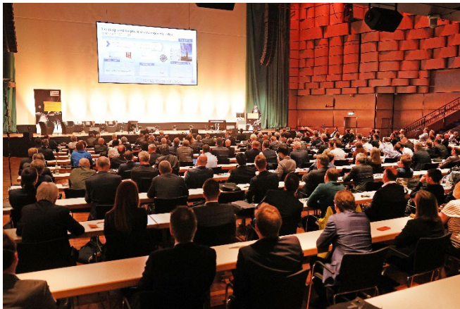
Image 2: More than 500 participants learned about tomorrow's production solutions in 87 presentations at AKL'22.