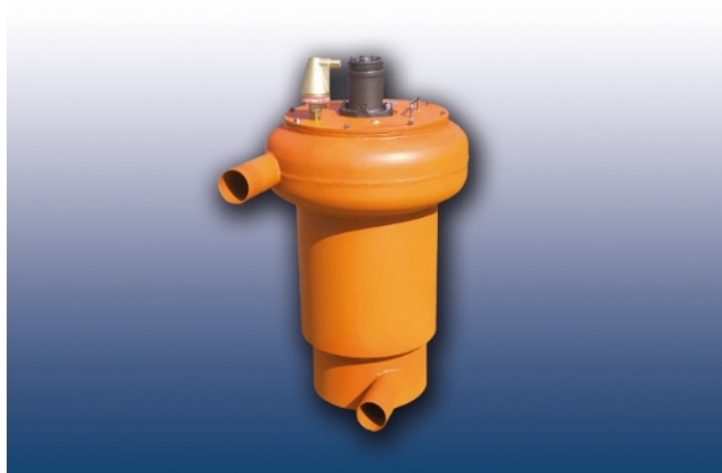
Image 2: The aim of the SimConDrill project is to build a cyclone filter that can efficiently remove tiny plastic particles from large quantities of water.